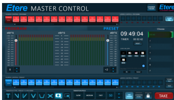
(ETERE MASTER CONTROL)