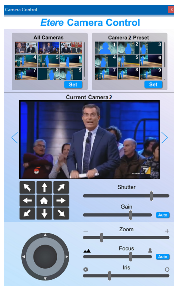
(Etere Camera Control)