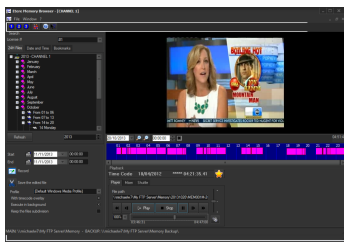
(Memory screen capture)