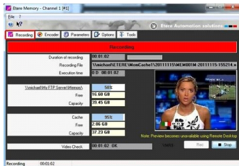
(Etere Memory screen)

Etere solutions manage the end-to-end media lifecycle of broadcast and media enterprises. Under the reliable web of the Etere Ecosystem, streamline your entire workflow with Etere solutions that feature seamless integration and useful operability. As the world's first producer of software only broadcasting solutions, Etere solutions are sure to declutter your control rooms, increase productivity, and encourage a better range of adaptability and scalability. Take the first step to achieve the results-driven success that you want. We can help you to attain results that are tailored for your success. Talk to us at info@etere.com