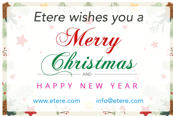
(Happy holidays etere)

We would like to thank our valued friends, partners, and customers for a fantastic year together and wish everyone a Merry Christmas and Happy New Year!