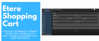
(Etere Shopping chart)