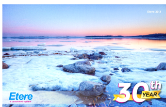
(Etere 30.3 wallpaper)

Adaptability and future scalability are important considerations when it comes to choosing a system for your business needs. Indonesia's state-owned TV station, Televisi Republik Indonesia (TVRI) upgrades to Etere 30.3 to tap on the latest innovations and to optimise the performance of their broadcast system. The station has been on-air with Etere since 2005. Etere empowers TVRI with a system driven by fully-customisable workflows, enabling their system to be perfectly in tune with their business and operational needs. As part of its customer support contract, Etere provides unlimited software upgrades and updates to meet evolving industry challenges. With a quick and easy software download, you can ensure your system is always ready to run with the latest features.